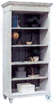
Hartford White Open Bookcase