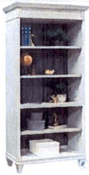
Hartford White Open Bookcase